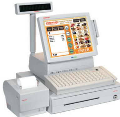
Real mount customer pole display