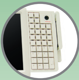
36 key dynakey with keylock attachment, optional: MSR, Smart card reader