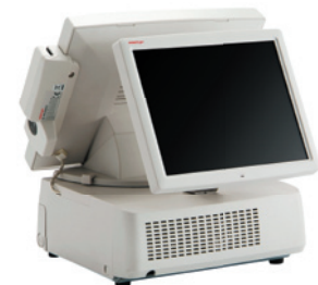
Customer Display Module Optional 12.1" LCD display unit mounts on rear bracket of HT stand